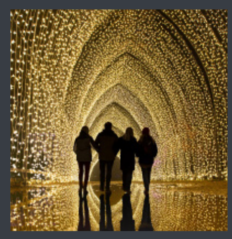
*Only specific evenings, please confirm with our team when booking

Speak with our events team for further details on how to tailor your event. Why not add breakfast, face paint artists or Zoo Ranger talks?