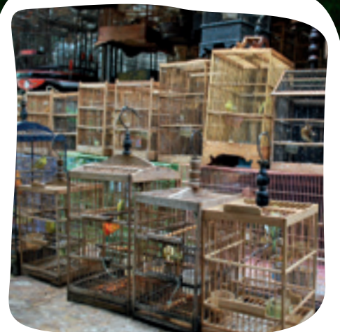
Bird market in Jakarta, Java

It's believed that over 1.3 million Songbirds are caught every year.