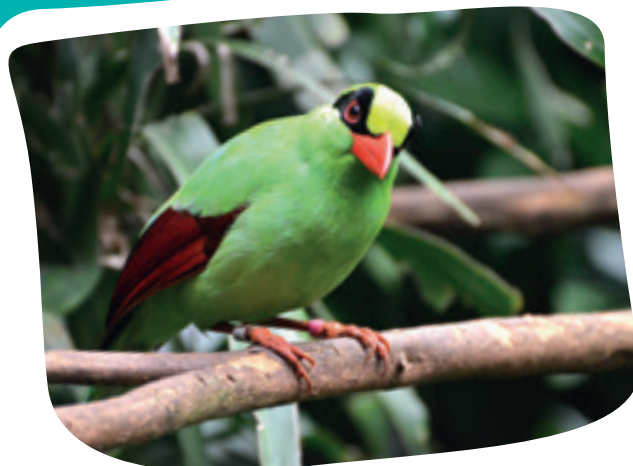
Javan green magpie

Donate £1 and dress in your favourite clothes - or even in fancy dress!