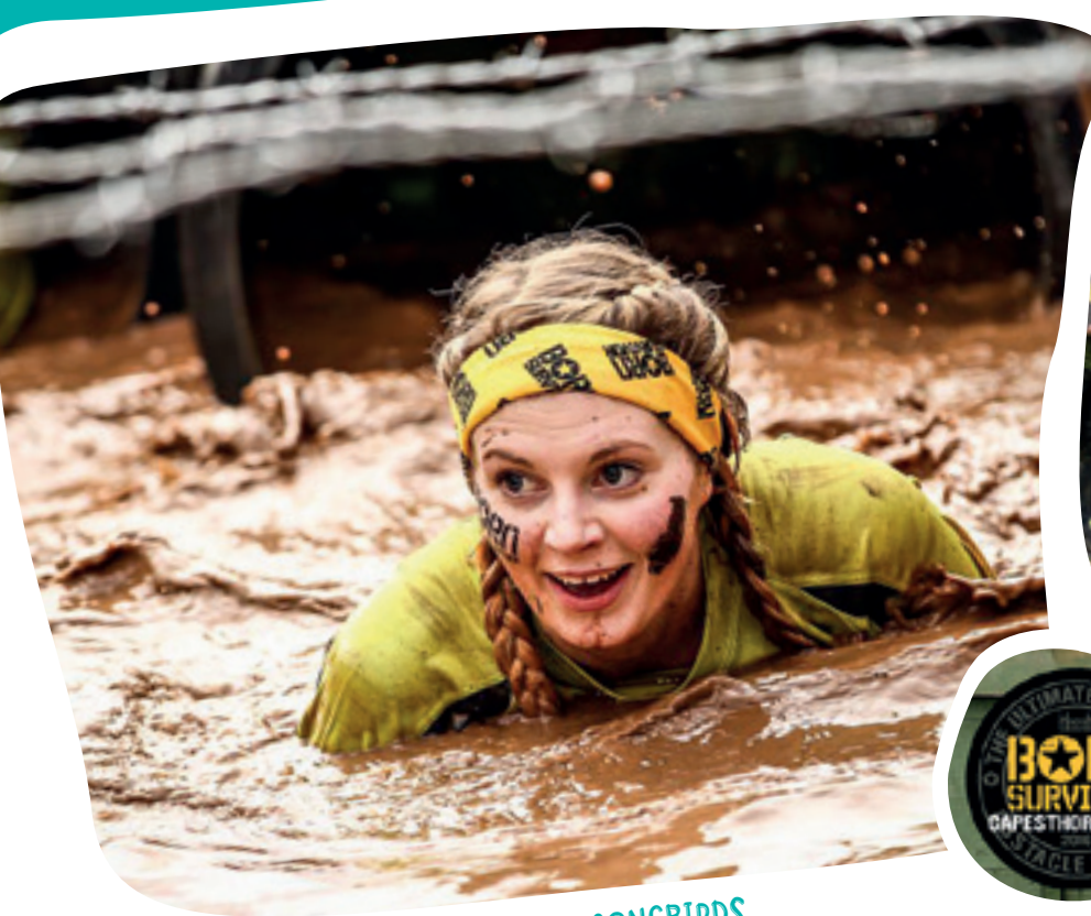
Experience trail running and ACT FOR SONGBIRDS

Fly over the obstacles by taking part in a trail running event like Tough Mudder or Born Survivor.