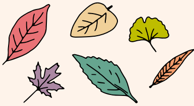
Lots of leaves